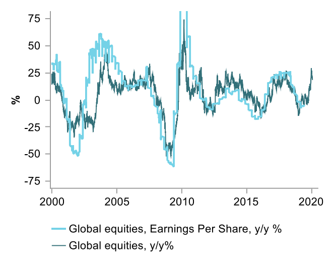
Figure 1: Global equities (MSCI) earnings per share vs. prices (lead 156 days)

What a difference a year makes. After a bruising 2018, last year allowed investors to capture the second-best return on a blend of global equities and long-dated bonds in 30 years. For stocks it was also a year of record multiple expansion, trounced on only one occasion since the late 1980s – in 2009, when markets were recovering from the crushing financial crisis. Ergo: in 2020, earnings will need to "grow in" to prices for the rally to have "legs" (Figure 1).